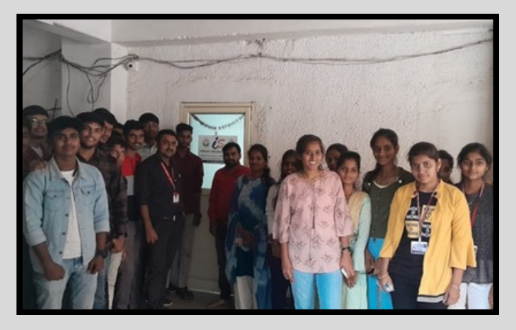
The Computer Engineering Department organized an industrial visit to "Secure Net IT Solutions," located in Korti.

Industrial Visit to Secure Net IT Solutions, Korti On 22th Jan. 2024.